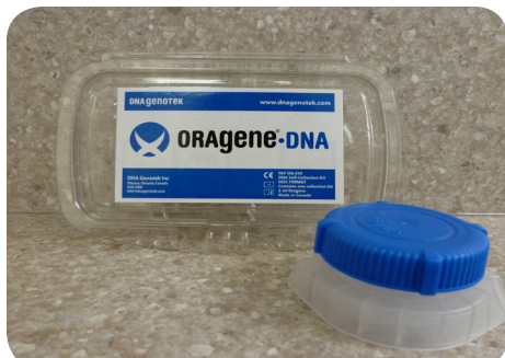
The Tomorrow Project Oragene Saliva Kit that will be mailed to you in lieu of visiting a Study Centre. (October 2012)

This small commitment of time from residents across Alberta will speak volumes in terms of community wellness in the future.